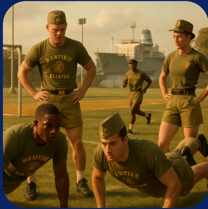
Physical Training & Sports