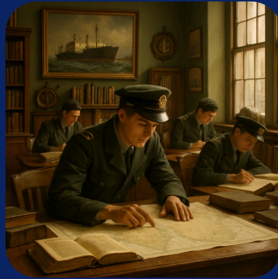
Library & Study Resources